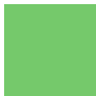
TK Hide 9 Colors